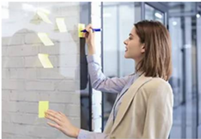
R&D+i projects coordination