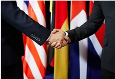
Export Consortiums (ExC)