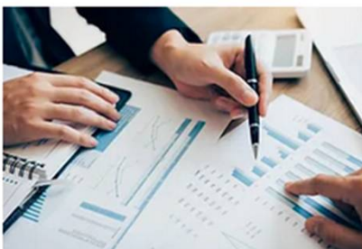
Customized financial plans