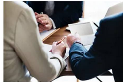
Joint Ventures agreements