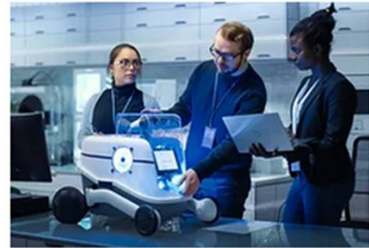
Consortiums of Innovation (Col)