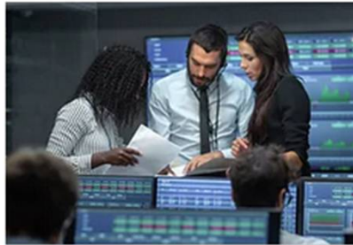
External Global Purchasing (exGP)