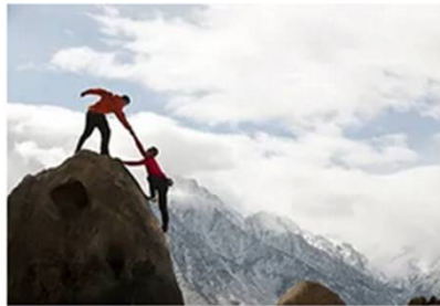
Strategies for Scale-up