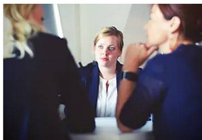
Grants and Technical Office